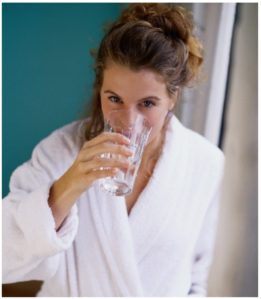
Drinking plenty of water after a massage is important for helping wash toxins from the body.

- Assists with shorter labor for expectant mothers, as well as reduces the need for medication, eases postpartum depression and anxiety, and contributes to a shorter hospital stay.